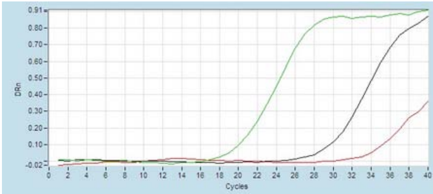
Synthesized standard amplification curve (10nM/100pM)