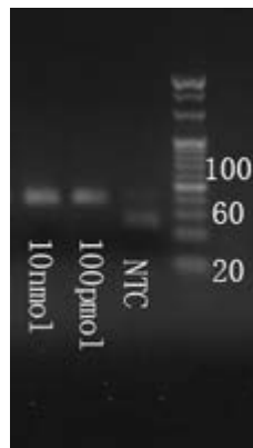
Electrophoresis Image (20bp marker)

Application key: E- ELISA, WB- Western blot, IH- Immunohistochemistry, IF- Immunofluorescence, FC- Flow cytometry, IC- Immunocytochemistry, IP- Immunoprecipitation, CHIP- Chromatin Immunoprecipitation, EMSA- Electrophoretic Mobility Shift Assay, BL- Blocking, SE- Sandwich ELISA, CBE- Cell-based ELISA, RNAi- RNA interference