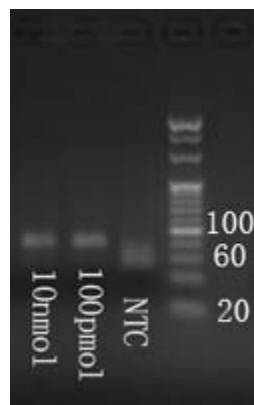
Electrophoresis Image (20bp marker)

Application key: E- ELISA, WB- Western blot, IH- Immunohistochemistry, IF- Immunofluorescence, FC- Flow cytometry, IC- Immunocytochemistry, IP- Immunoprecipitation, CHIP- Chromatin Immunoprecipitation, EMSA- Electrophoretic Mobility Shift Assay, BL- Blocking, SE- Sandwich ELISA, CBE- Cell-based ELISA, RNAi- RNA interference