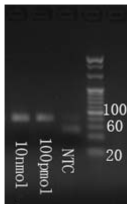
Electrophoresis Image (20bp marker)

Application key: E- ELISA, WB- Western blot, IH- Immunohistochemistry, IF- Immunofluorescence, FC- Flow cytometry, IC- Immunocytochemistry, IP- Immunoprecipitation, CHIP- Chromatin Immunoprecipitation, EMSA- Electrophoretic Mobility Shift Assay, BL- Blocking, SE- Sandwich ELISA, CBE- Cell-based ELISA, RNAi- RNA interference