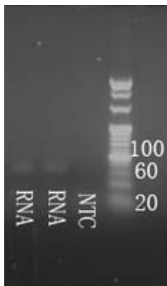
Electrophoresis Image (20bp marker)

Application key: E- ELISA, WB- Western blot, IH- Immunohistochemistry, IF- Immunofluorescence, FC- Flow cytometry, IC- Immunocytochemistry, IP- Immunoprecipitation, CHIP- Chromatin Immunoprecipitation, EMSA- Electrophoretic Mobility Shift Assay, BL- Blocking, SE- Sandwich ELISA, CBE- Cell-based ELISA, RNAi- RNA interference