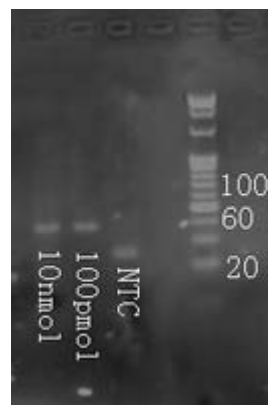
Electrophoresis Image (20bp marker)

Application key: E- ELISA, WB- Western blot, IH- Immunohistochemistry, IF- Immunofluorescence, FC- Flow cytometry, IC- Immunocytochemistry, IP- Immunoprecipitation, CHIP- Chromatin Immunoprecipitation, EMSA- Electrophoretic Mobility Shift Assay, BL- Blocking, SE- Sandwich ELISA, CBE- Cell-based ELISA, RNAi- RNA interference