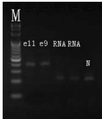
Electrophoresis Image (20bp marker)

Application key: E- ELISA, WB- Western blot, IH- Immunohistochemistry, IF- Immunofluorescence, FC- Flow cytometry, IC- Immunocytochemistry, IP- Immunoprecipitation, CHIP- Chromatin Immunoprecipitation, EMSA- Electrophoretic Mobility Shift Assay, BL- Blocking, SE- Sandwich ELISA, CBE- Cell-based ELISA, RNAi- RNA interference