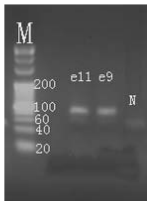
Electrophoresis Image (20bp marker)

Application key: E- ELISA, WB- Western blot, IH- Immunohistochemistry, IF- Immunofluorescence, FC- Flow cytometry, IC- Immunocytochemistry, IP- Immunoprecipitation, CHIP- Chromatin Immunoprecipitation, EMSA- Electrophoretic Mobility Shift Assay, BL- Blocking, SE- Sandwich ELISA, CBE- Cell-based ELISA, RNAi- RNA interference