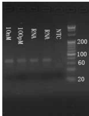
Electrophoresis Image (20bp marker)

Application key: E- ELISA, WB- Western blot, IH- Immunohistochemistry, IF- Immunofluorescence, FC- Flow cytometry, IC- Immunocytochemistry, IP- Immunoprecipitation, CHIP- Chromatin Immunoprecipitation, EMSA- Electrophoretic Mobility Shift Assay, BL- Blocking, SE- Sandwich ELISA, CBE- Cell-based ELISA, RNAi- RNA interference