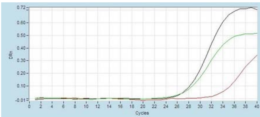
Amplification curve in total RNA from cells