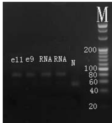
Electrophoresis Image (20bp marker)

Application key: E- ELISA, WB- Western blot, IH- Immunohistochemistry, IF- Immunofluorescence, FC- Flow cytometry, IC- Immunocytochemistry, IP- Immunoprecipitation, CHIP- Chromatin Immunoprecipitation, EMSA- Electrophoretic Mobility Shift Assay, BL- Blocking, SE- Sandwich ELISA, CBE- Cell-based ELISA, RNAi- RNA interference