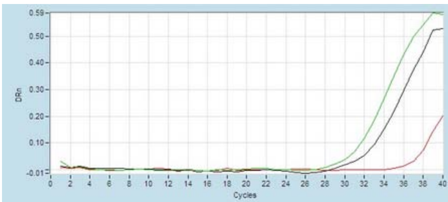
Amplification curve in total RNA from cells