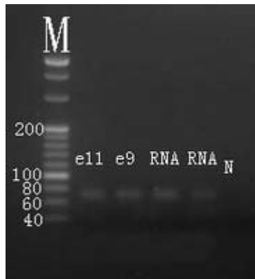
Electrophoresis Image (20bp marker)

Application key: E- ELISA, WB- Western blot, IH- Immunohistochemistry, IF- Immunofluorescence, FC- Flow cytometry, IC- Immunocytochemistry, IP- Immunoprecipitation, CHIP- Chromatin Immunoprecipitation, EMSA- Electrophoretic Mobility Shift Assay, BL- Blocking, SE- Sandwich ELISA, CBE- Cell-based ELISA, RNAi- RNA interference