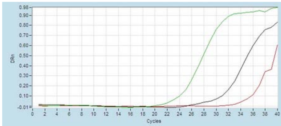
Fig. 1 ssc-mir-369 amplification curve in 10nM and 100pM synthetic miRNA standard

The product is tested functionally by qRT-PCR using four kinds of template: 10 nM and 100 pM synthetic miRNAs standard and total RNA from two cells. Kinetic analysis must demonstrate a linear dose response with decreasing target concentration.