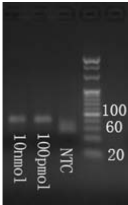
Fig. 3 Electrophoresis Image (20bp marker)