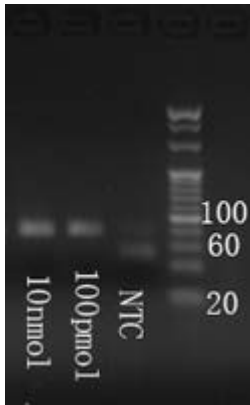
Fig. 3 Electrophoresis Image (20bp marker)