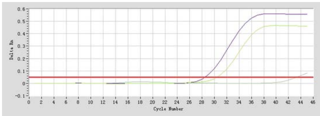
Fig. 2 Amplification curve in total RNA from cells