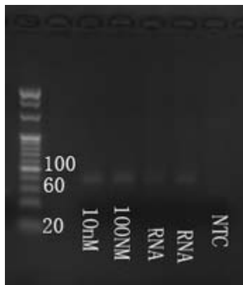
Fig. 4 Electrophoresis Image (20bp marker)