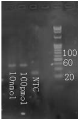
Fig. 3 Electrophoresis Image (20bp marker)