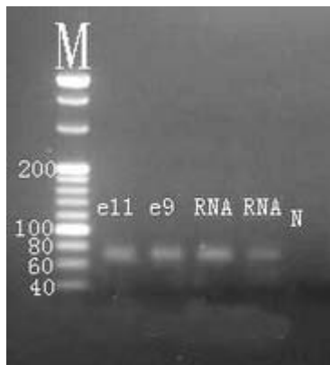
Fig. 4 Electrophoresis Image (20bp marker)