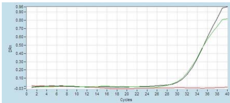
Fig. 2 Amplification curve in total RNA from cells