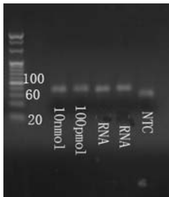
Fig. 4 Electrophoresis Image (20bp marker)