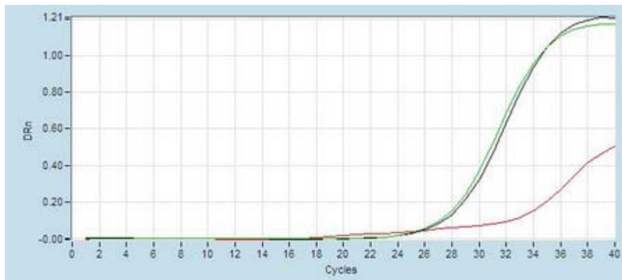
Fig. 2 Amplification curve in total RNA from cells