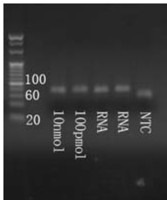
Fig. 4 Electrophoresis Image (20bp marker)