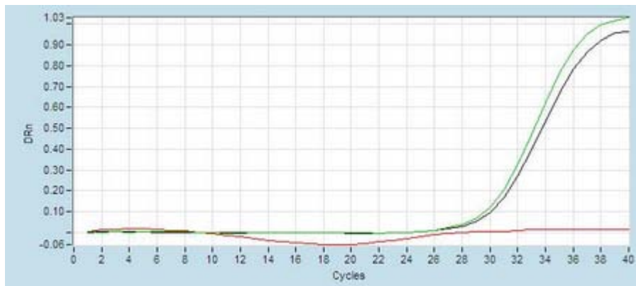
Fig. 2 Amplification curve in total RNA from cells