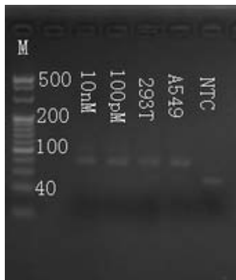
Fig. 4 Electrophoresis Image (20bp marker)