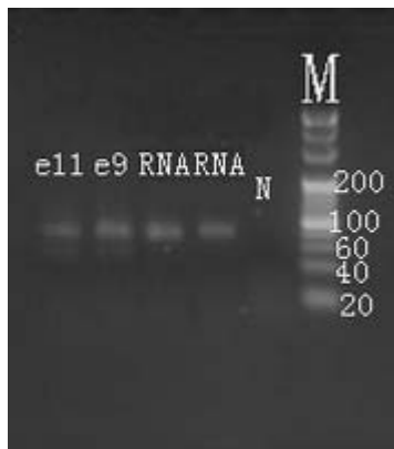
Fig. 4 Electrophoresis Image (20bp marker)