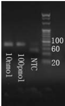
Fig. 3 Electrophoresis Image (20bp marker)