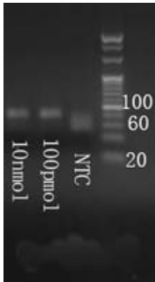
Fig. 3 Electrophoresis Image (20bp marker)