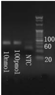
Fig. 3 Electrophoresis Image (20bp marker)