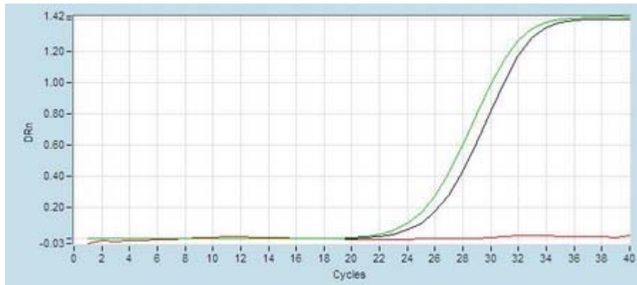
Fig. 2 Amplification curve in total RNA from cells