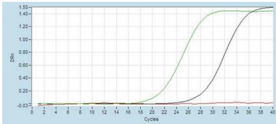
Fig. 1 rno-mir-183 amplification curve in 10nM and 100pM synthetic miRNA standard

The product is tested functionally by qRT-PCR using four kinds of template: 10nM and 100pM synthetic miRNAs standard and total RNA from two cells. Kinetic analysis must demonstrate a linear dose response with decreasing target concentration.