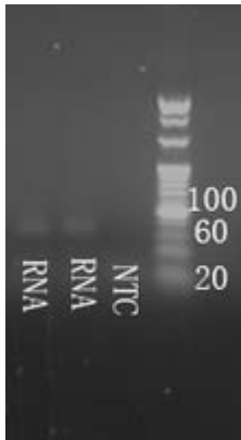
Fig. 3 Electrophoresis Image (20bp marker)