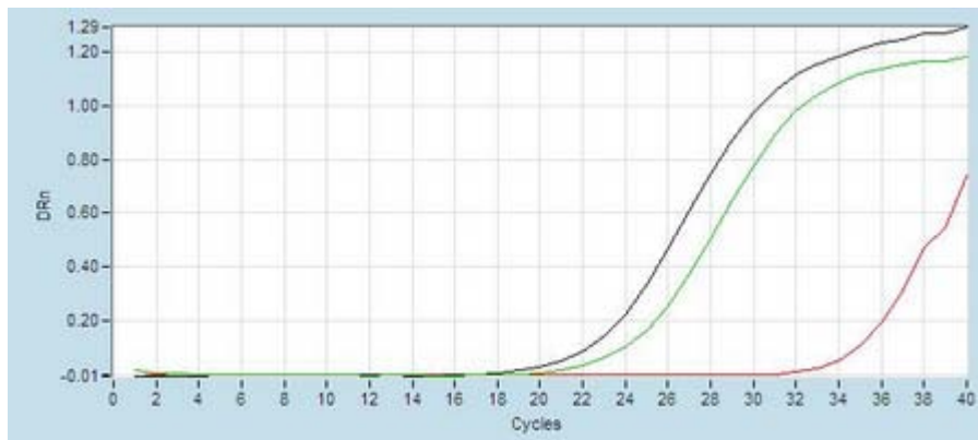
Fig. 2 Amplification curve in total RNA from cells