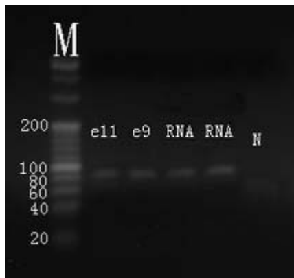
Fig. 4 Electrophoresis Image (20bp marker)