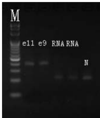
Fig. 4 Electrophoresis Image (20bp marker)