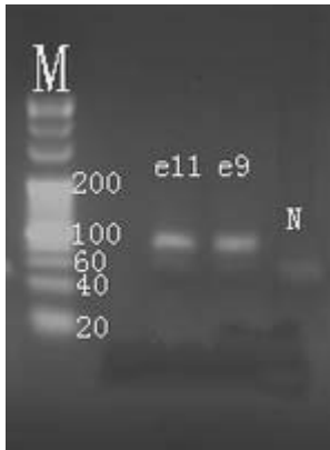
Fig. 3 Electrophoresis Image (20bp marker)