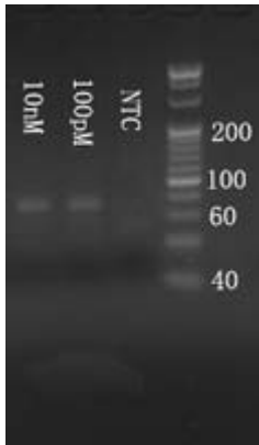
Fig. 3 Electrophoresis Image (20bp marker)