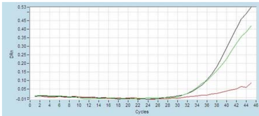
Fig. 2 Amplification curve in total RNA from cells