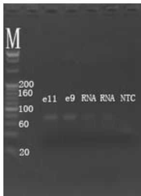
Fig. 4 Electrophoresis Image (20bp marker)