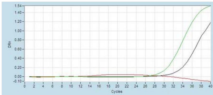
Fig. 2 Amplification curve in total RNA from cells