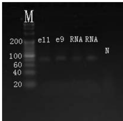
Fig. 4 Electrophoresis Image (20bp marker)