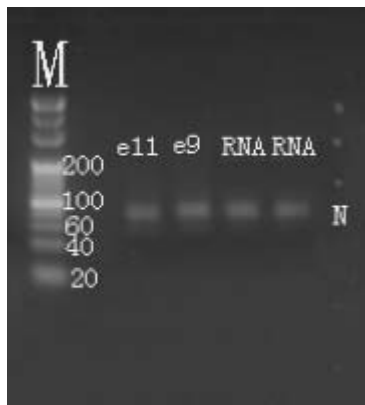
Fig. 4 Electrophoresis Image (20bp marker)