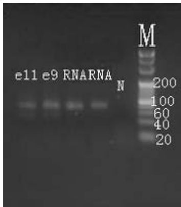
Fig. 4 Electrophoresis Image (20bp marker)