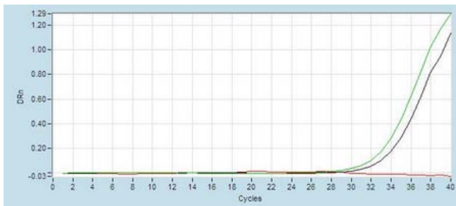
Fig. 2 Amplification curve in total RNA from cells